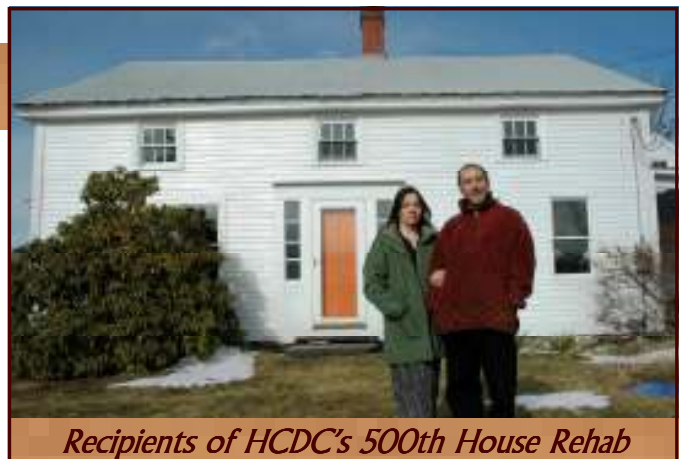
Recipients of HCDC's 500th House Rehab

HCDC's ongoing Housing Rehabilitation Program provides zero percent interest, deferred-payment loans to income-eligible homeowners for use in making a wide variety of repairs to their homes. The program also provides a source of steady year round employment for area contractors. The program's goal is to improve living conditions for low-moderate income households, and to improve the quality of the housing stock in the Hilltowns. During FY 2010 HCDC: