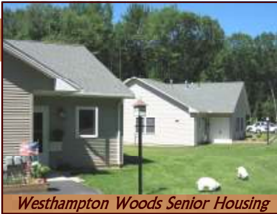
Westhampton Woods Senior Housing