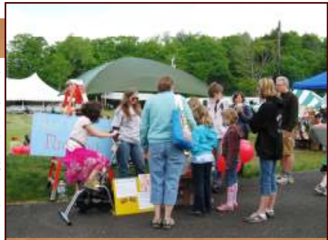
Local Business at Hilltown Spring Festival