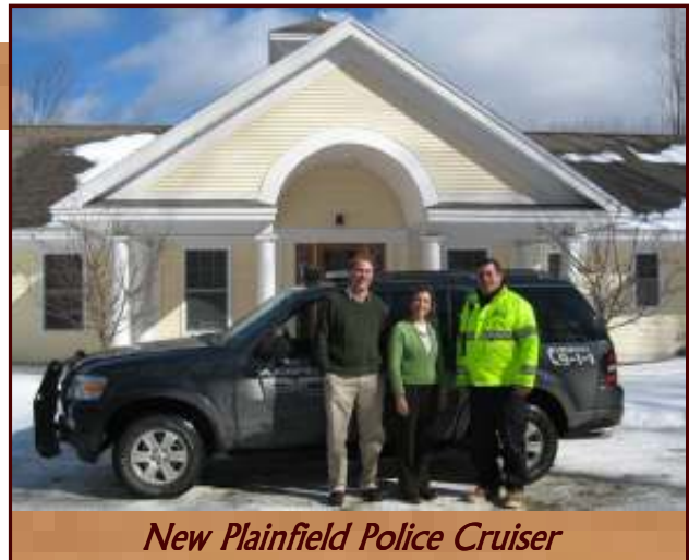
New Plainfield Police Cruiser