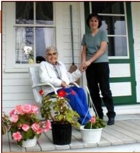
HEN Participant & Caregiver

Hilltown CDC seeks to support the highest possible quality of life for the most vulnerable residents of our Hilltown community. We work to bring social services to the residents of the Hilltowns through organization, advocacy, resource development and direct program administration . During FY 2010 Hilltown CDC: