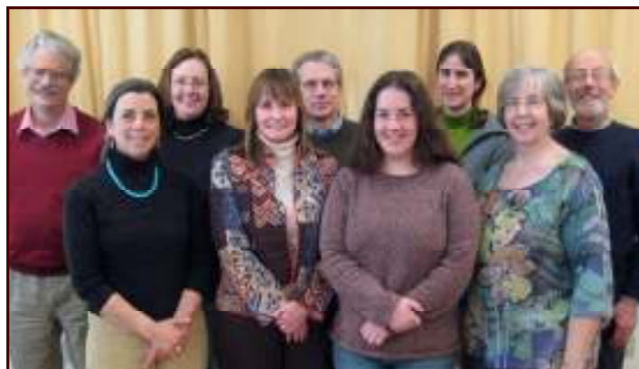
Hilltown CDC Staff