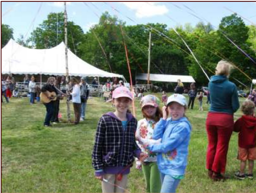
Hilltown CDC Spring Festival